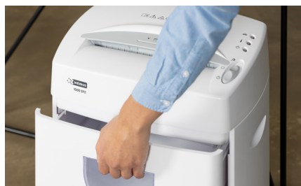
Removable 22-litre collection bin for easy disposal.