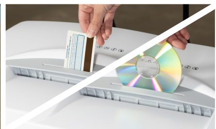
Credit cards and CDs can also be shredded via a separate feed slot.