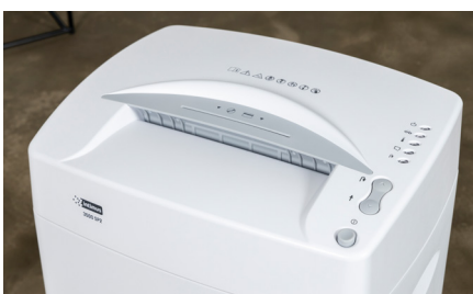
Intuitive operation thanks to clear push buttons and LED display.