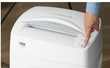
Automatic start/stop function and anti-paper jam technology.