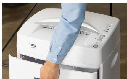
Removable 42-litre collection bin for easy disposal.