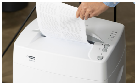
Shreds documents with paper clips and staples.